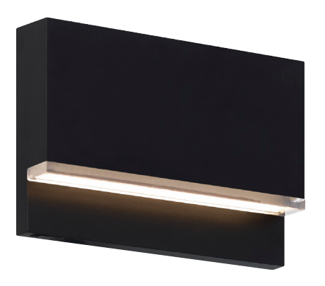
WEND OUTDOOR WALL/STEP LIGHT shown in black