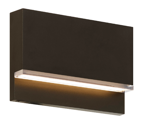
WEND OUTDOOR WALL/STEP LIGHT shown in bronze