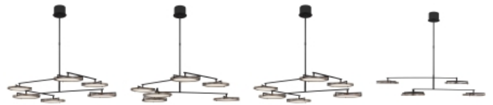
Weathered Oak/Nightshade Black